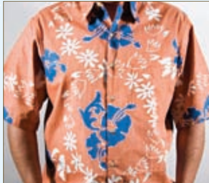
2006 SURFRIDER ALOHA classic Reyn Spooner 100% cotton shirt M-L-XL-XXL ON SALE $50 LIMITED EDITION – MADE IN HAWAII